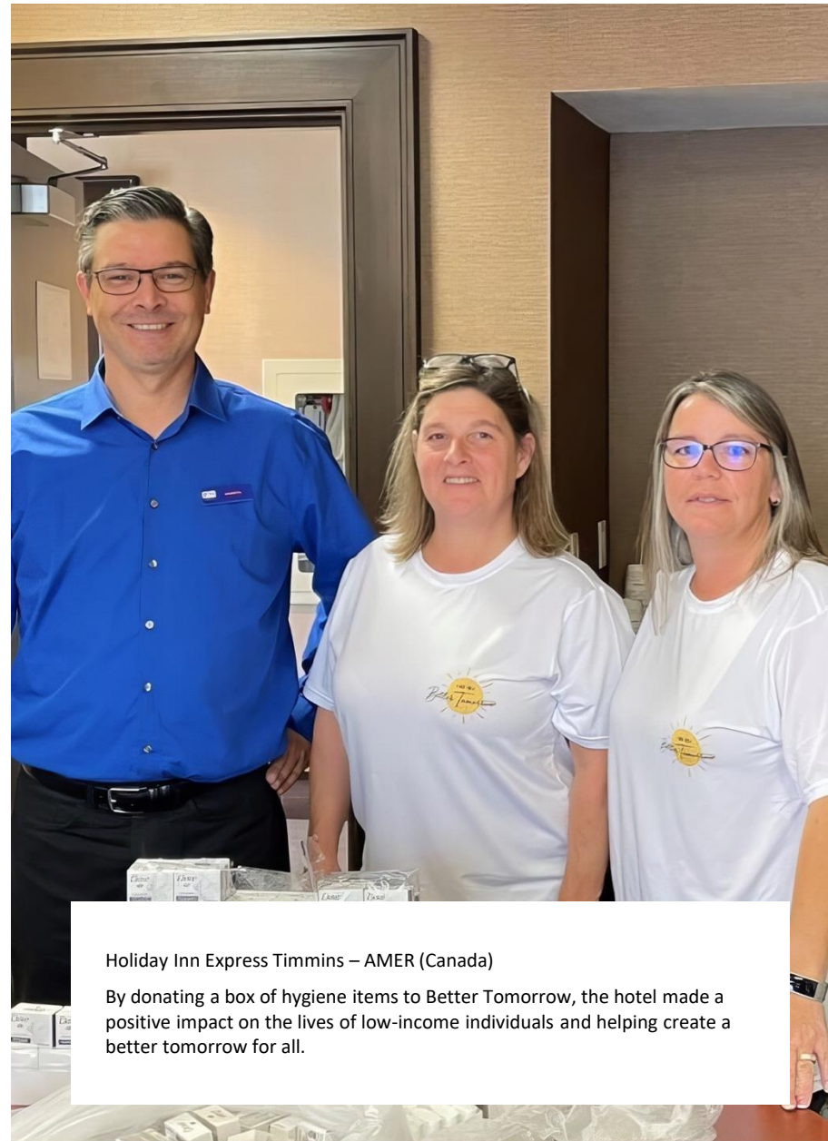
Holiday Inn Express Timmins – AMER (Canada)

By hosting a hygiene kit drive, you can make a tangible difference in the lives of those in need, providing essential hygiene supplies and promoting dignity and well-being. Your contribution will create a positive impact, fostering a sense of community and compassion within our hotel and beyond.